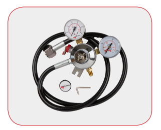
PREMIUM PLUS PR 1