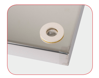
RUBBER FOOT FOR DRIPTRAY